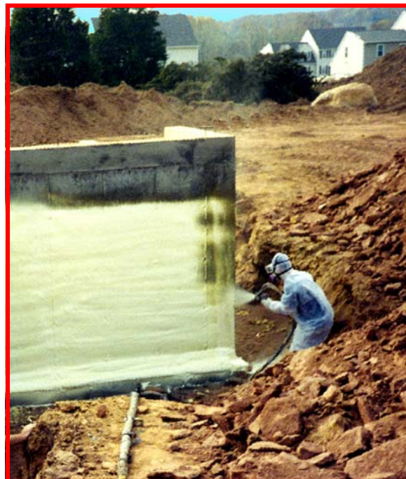
Spray Application to Exterior Foundation Wall

Spray-in-place polyurethane has been the insulation of choice for masonry construction in commercial applications since the 1980's. As homeowners demand more energy efficient designs, the use of polyurethane insulation has been rapidly expanding. One of the best residential applications derived from the commercial market is below grade