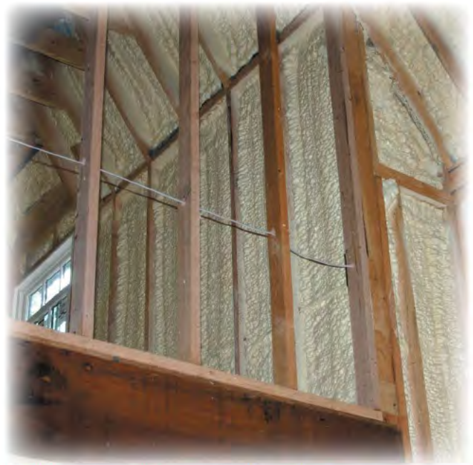
With the home well encapsulated in SPF, it was important to downsize the air conditioner. Bigger units in well-insulated homes tend to not run long enough to allow humidifiers to properly remove moisture.