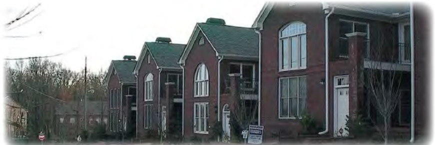
Magnolia Park, a townhouse community complex by Dick Dunn & Associates

“At first, I was concerned about the additional cost of the spray foam, but the value is so much greater. There’s the lack of opportunity for mold growth, improved sound,