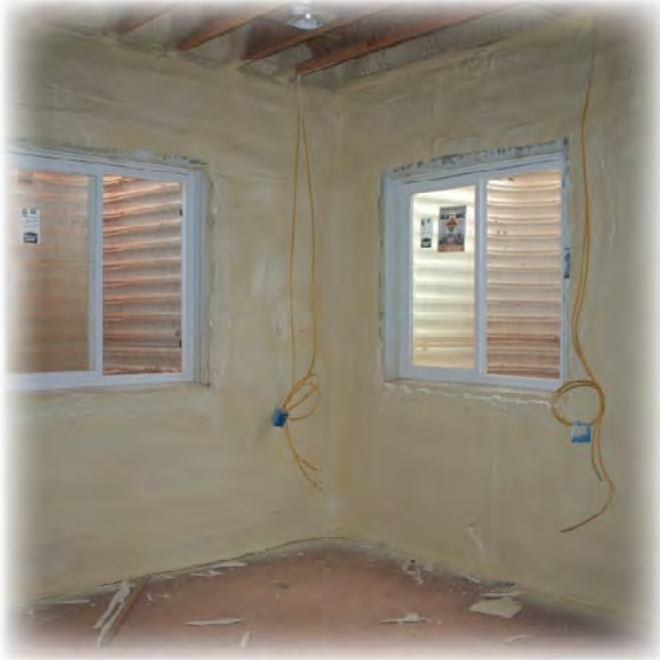
The basement features an AVI-designed home theatre and video library. In addition to rigid cell foam, Ledbetter and Trigg teamed up to make the 30' x 60' home theatre acoustically correct with Profoam's Proseal and their .5 lb. water-blown Profill SHS.

Virtually no expense was spared in constructing the home. The spec mansion featured a Rinnai tankless water heater, Boiseengineered silent wood floors, Solartube skylights, Viking appliances, and an AVI-designed home theatre and video library. Ledbetter and Trigg teamed up to make the 30-by 60-foot home theater acoustically correct.