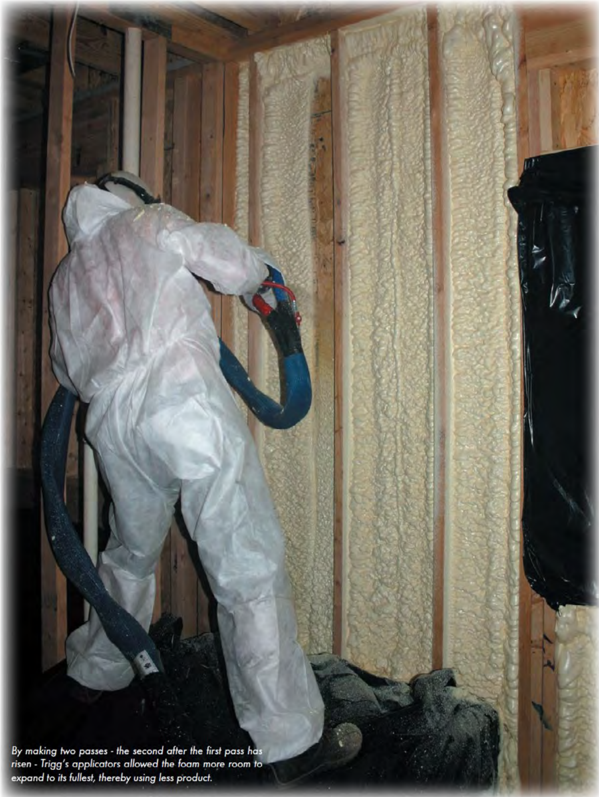
By making two passes - the second after the first pass has risen - Trigg's applicators allowed the foam more room to expand to its fullest, thereby using less product.