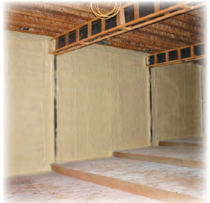
Trigg sprayed 3" of 1.9 lb. rigid foam on the ceiling and walls, followed by 5" of .5 lb. open cell foam. If sound passes through the open cell, it should bounce off the rigid foam.

Beyond adding to the structure's strength, the composite foam layer will reduce reverberations passing through. “We shouldn't get a lot of bass bouncing throughout the room, and we should be pretty successful stopping sound from seeping out of the room. If the sound passes through the closed-cell, we're hoping it bounces off the rigid foam,” Ledbetter explains.