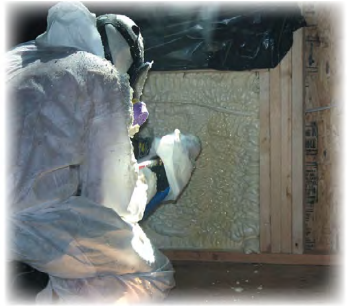
Ledbetter and Shannon Trigg, owner of Foam Plus, hope their unique combination of product and talents helps them win a future bid for 27 similar homes. Profoam's Proseal SFC 1.9 lb./sq.ft, closed-cell polyurethane between the beams and rafters adds dimensional stability.

"We get calls all the time from contractors who have climbed up into attics we've done and ask if the attic