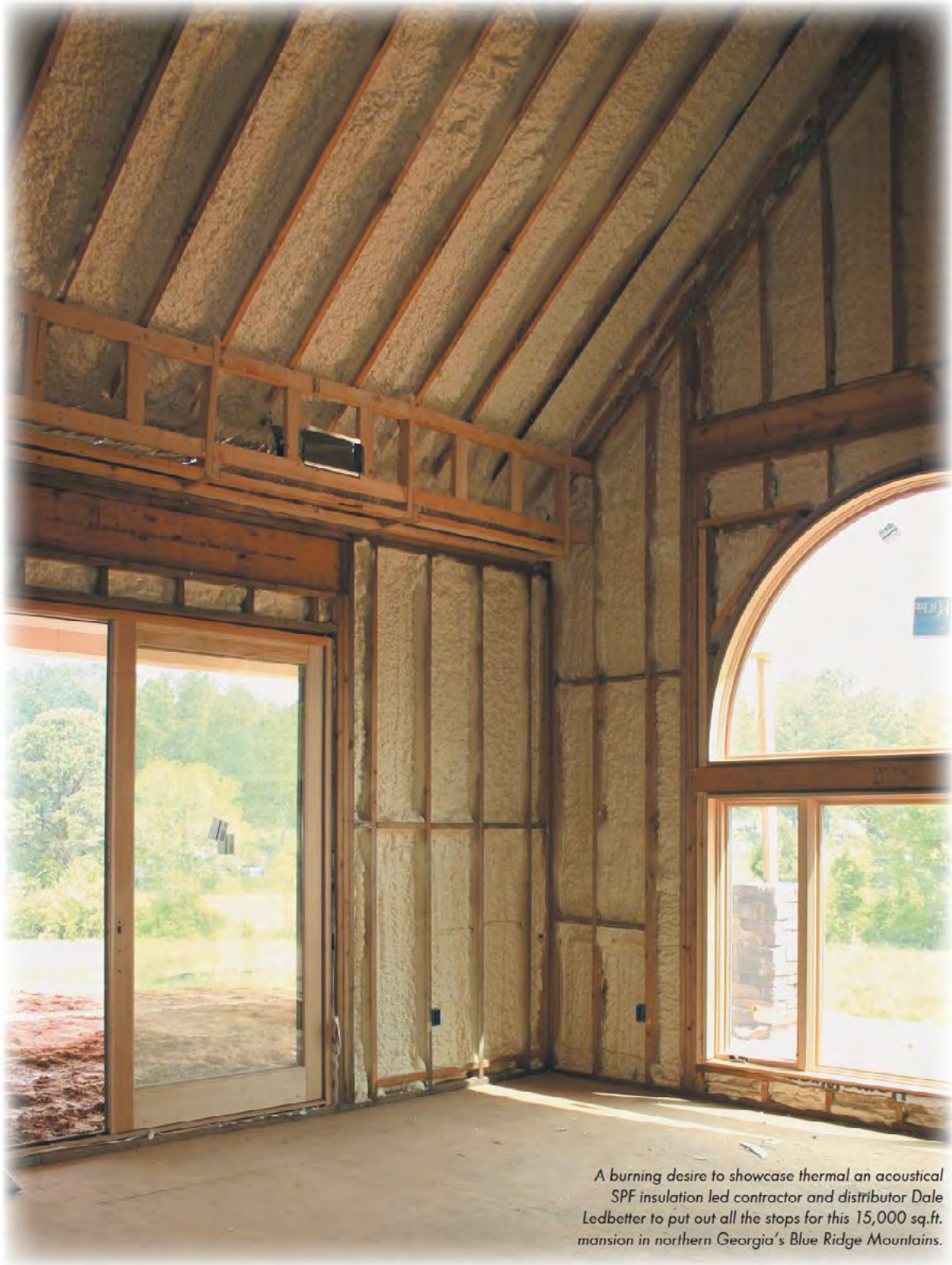
A burning desire to showcase thermal and acoustical SPF insulation led contractor and distributor Dale Ledbetter to put out all the stops for this 15,000 sq.ft. mansion in northern Georgia's Blue Ridge Mountains.